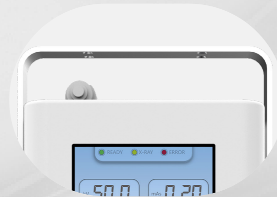
① Compact and portable, Easy to use