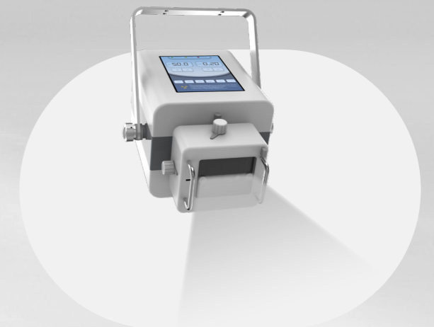
④ Flexible operation, fast imaging

Applicable to hospitals | medical clinics | nursing homes