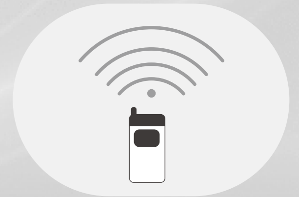
② Wireless controlled exposure