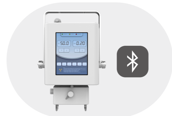
⑤ Bluetooth Support Easy connection to computer